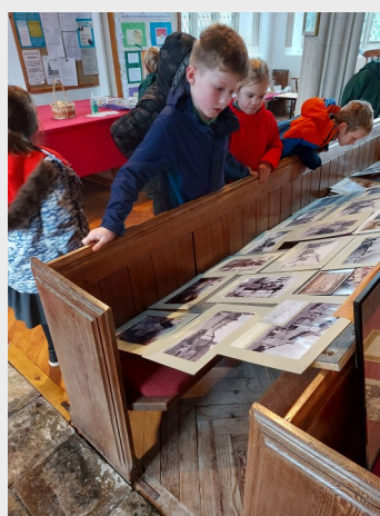
Quantock Class Weekly Plan: Week 11