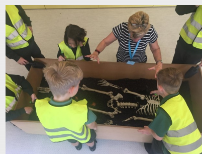
Quantock Class Weekly Plan: Week 7