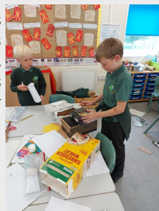
Quantock Class Weekly Plan: Week 6