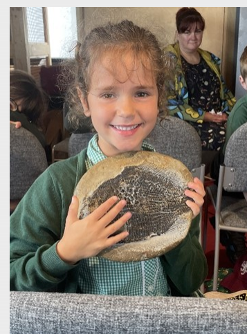
Horner Class Weekly Plan: Summer