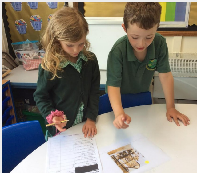
Horner Class Weekly Plan: Summer

This term we have been learning about Mary Anning. We have sequenced her life, wrote a character description, and thought about who the most important people to Mary were. This week we have been pretending to be historians. We analysed different historical sources to try and work out why we know so much about Mary Anning when she lived 200 years ago. We then matched the sources to a selection of facts about Mary Anning. We are very excited for our school trip next Wednesday to Lyme Regis to learn even more about Mary Anning and examine some artefacts.