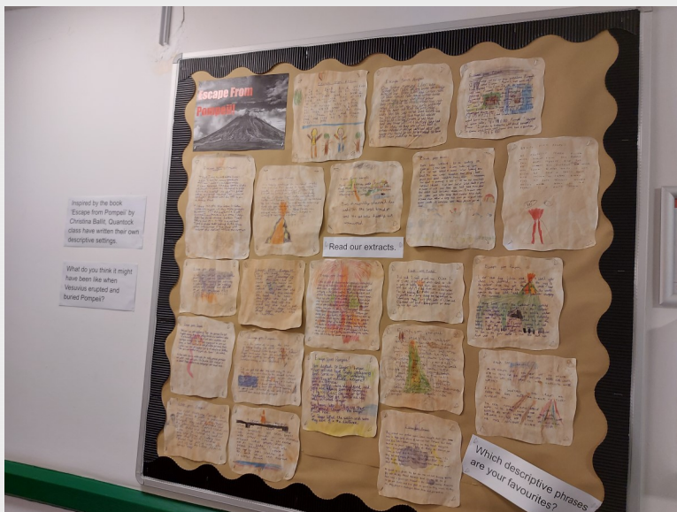
Quantock Class Weekly Plan: Week 5

This week has flown by as we've been busy mastering place value in maths and writing sets of instructions in English. The classroom is currently awash with cardboard boxes as we have started planning our own version of an ancient Roman town for our DT project this term. We are really looking forward to the construction phase over the next couple of weeks and have every confidence of completing on time! Please do try and pop into the office at some point before half term to look at our wonderful 'Escape from Pompeii' extracts. Everyone is, quite rightly, very proud of their writing.