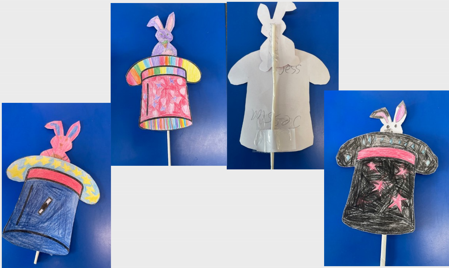
Horner Class Weekly Plan: Week 4

This week in DT, we made a simple slider in the context of a rabbit coming out of a top hat. We thought about how the slider moves and what the movement of the slider reminded us of. We really enjoyed making our slider creation and can't wait to make our horizontal slider next week in the context of a moving vehicle. You see some photos of our creations below: