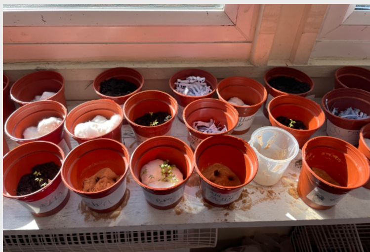
Horner Class Weekly Plan: Summer Week 7

In science, we have been investigating which material cress grows best in... sand, paper, cotton wool and soil. We learnt what a fair test was and also made predictions on what we thought would happen. We made sure we watered each pot with the same amount of water and put them in the same place - our class windowsill. We can't wait to find out the results of our experiment in a few days.