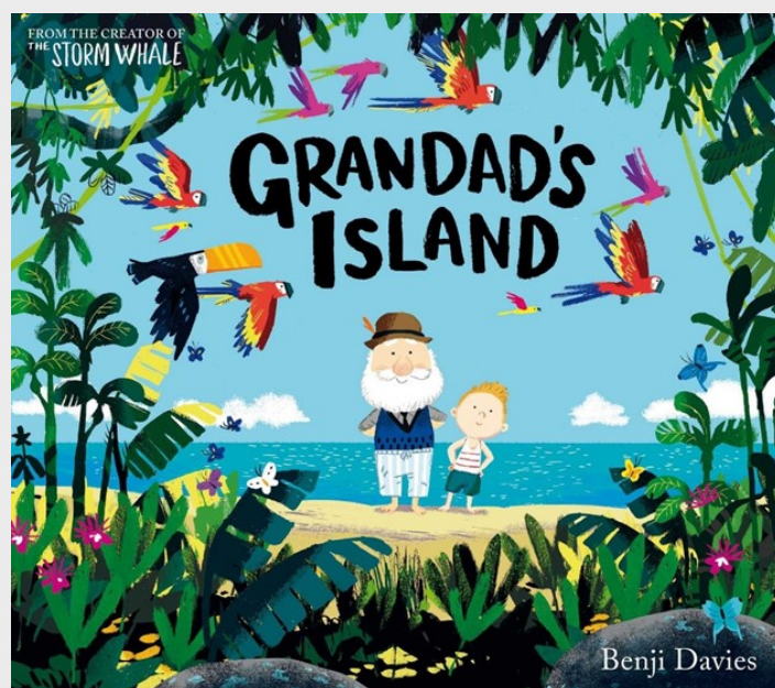
Horner Class Weekly Plan: Summer Week 10

This week in guided reading, we have been reading Grandad's Island. We have been very excited to find out what happens on the next page each day and to find out what was behind Grandad's magical door. We are just waiting to find out how Syd manages to get home after Grandad decides he wants to stay on the island with the animals.