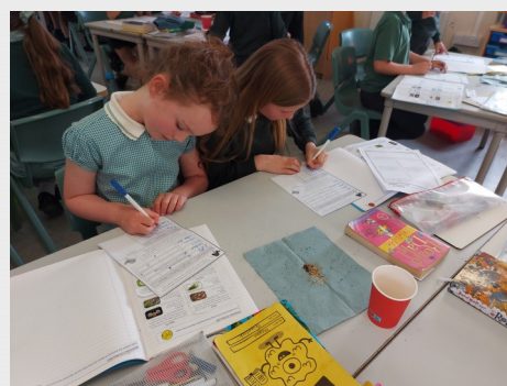
Quantock Class Weekly Plan: Week 32