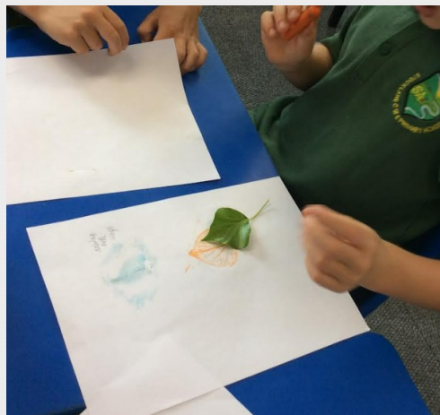
Horner Class Weekly Plan: Summer Week 9