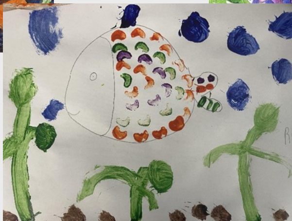
Horner Class Weekly Plan: Summer Week 2