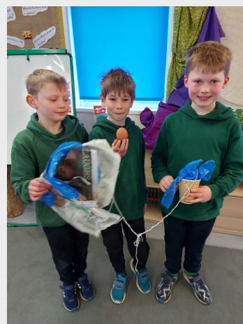
Quantock Class Weekly Plan: Week 27