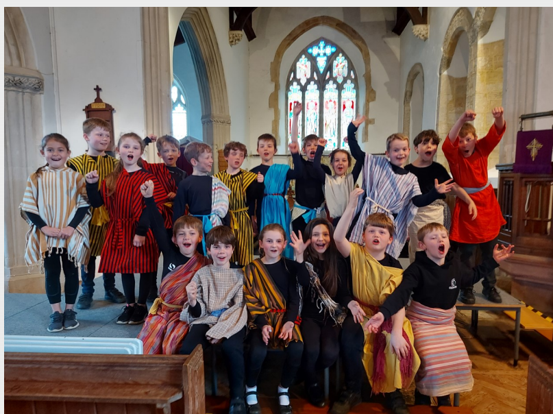
Quantock Class Weekly Plan: Week 26

Next week, as you will see from the timetable attached, Quantock class will be enjoying a STEAM week (Science, Technology, Engineering, Arts, Maths). We look forward to sharing our results from this with you next week!