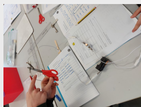
Quantock Class Weekly Plan: Week 22