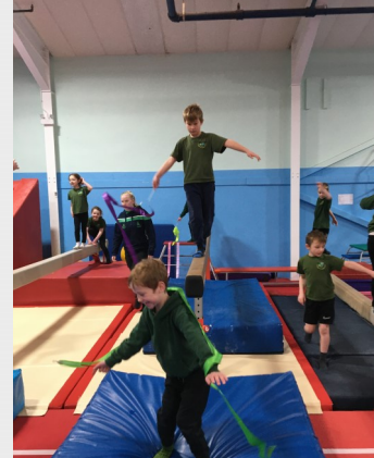
Quantock Class Weekly Plan: Week 19