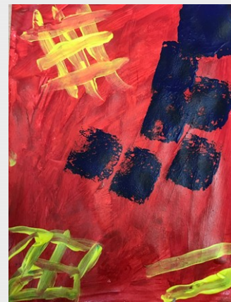
Horner Class Weekly Plan: Spring Week 5