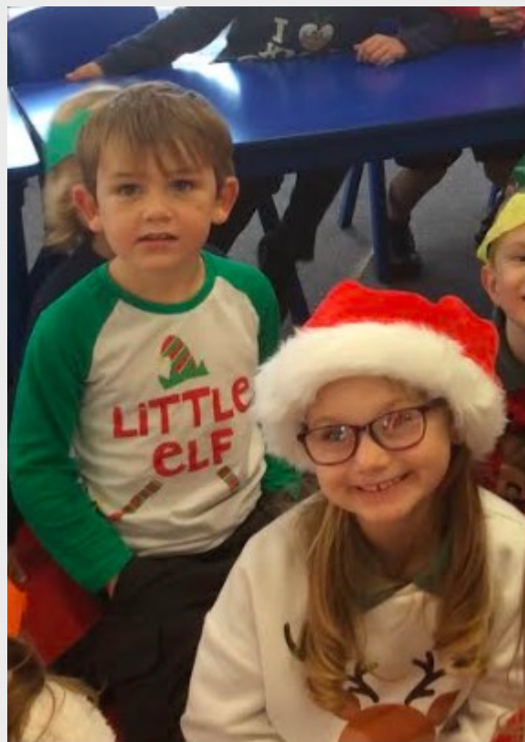
Horner Class Weekly Plan: Week 14

This week Horner class have been involved in lots of Christmas festivities. We have been practicing our nativity, Lights Camel Action and learning all the songs, lines and dances. We are excited to put on a super show for you next week. We all enjoyed a delicious Christmas lunch in our Christmas jumpers with crackers.